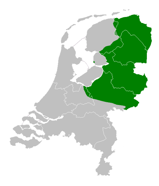
Figure 1: The Dutch Low Saxon dialect area (GRÖNNEGER1 (2009)).

The Dutch Low Saxon dialect varieties under discussion are a diverse group of Low Saxon— i.e. Low German—dialects spoken in the northeastern area in the Netherlands. Figure 1 shows that varieties occur in the Dutch provinces of Groningen, Drenthe, Overijssel, the Veluwe and Achterhoek regions in Gelderland, and the Stellingwerven areas in southern Friesland (BLOEMHOFF, 2009). Even though Low Saxon dialects are found throughout northern Germany in an area approximately three times as large as the entire Netherlands, Dutch Low Saxon dialects are considered to be varieties of Dutch (NIEBAUM AND MACHA, 2006:221).